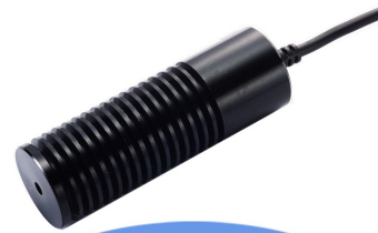
HB3532 Laser Module

The high-end 532nm DPSS Green Laser Diode Modules produce a collimated output beam with output powers of <1\text{mW} or <5\text{mW} . Operating voltage is from 2.8V to 6V DC at an operating current of 150~300mA, 180mA typ. ( <1\text{mW} ) or 240mA typ. ( <5\text{mW} ). For -L (Low Power Consumption) model, the operating current is only 80mA typ. ( <1\text{mW} ) and 120mA typ. ( <5\text{mW} ). Beam divergence is <0.5\text{mrad} and operating temperature range is 15^\circ\text{C} to +40^\circ\text{C} . The modules consist of a brass housing, laser diode, crystal, drive circuit and collimating/focusing lens. Electrical connections are made via external flying leads. The lens may be adjusted to produce either a collimated beam or focused spot. The compact design has made HB3532/HB3532-L series DPSS green laser diode modules suitable for general purpose OEM application.